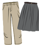
PANTS & SKIRTS